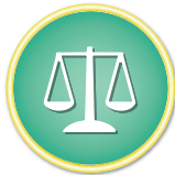
Legal & Public Safety