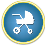
Early Childhood & Maternity