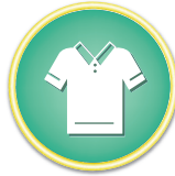
Clothing and Household