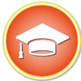
GED & Education