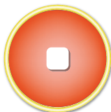
Trafficking & Violence