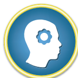
Mental Health & Substance Abuse