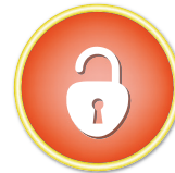
Inmate & Re-entry Services