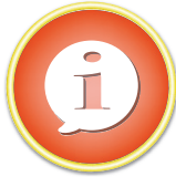
City and County Services

Hundreds of resources for the folks in Hampton Roads are just a click away.