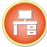
Employment, Training & Adult Education